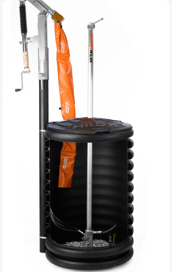
Utilization of System Capacity

The HKD KLIK hydrant is available in three lengths, 12", 48" and 96" and is capable of operating on surface or buried pipe. The HKD KLIK hydrant can be automated.