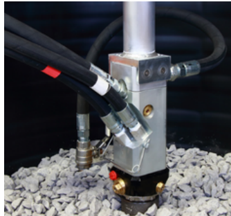
Utilization of System Capacity